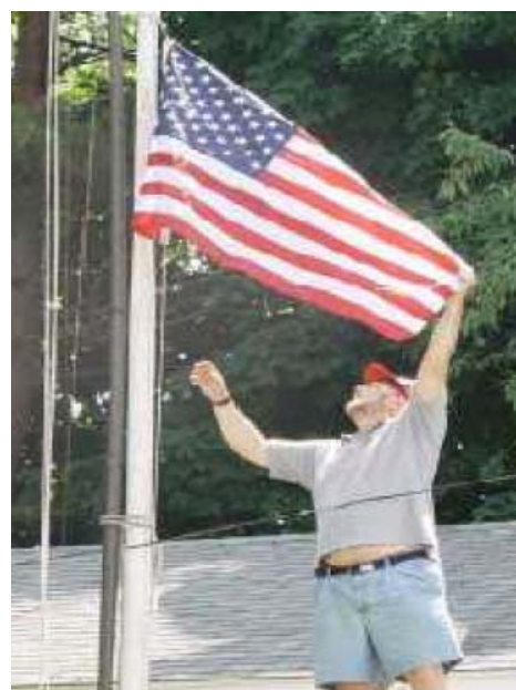
Raising the Flag at Field Day