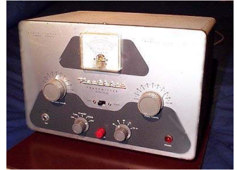
An example of a Heathkit DX-40 Transmitter built by thousands of Hams in the 1950s and 1960s.