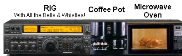
The Ideal Field Day Rig?

10. Thou shalt not make unauthorized modifications to equipment. but causeth thou to record all field changes and authorized modifications made by thee, lest thy successor tear his hair out and go slowly mad in his attempt to decide what manner of creature hath made a nest in the wiring of such equipment,