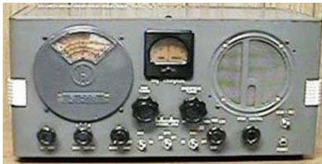
The Hallicrafters S20R Sky Champion was manufactured from 1939 to 1945 and was a general coverage receiver.