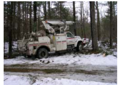
Verizon Line Truck stuck on the ice

The last 700 feet to the building is still laying on the ground awaiting warmer weather when we can get up there and pull it back up in the trees, and finish cleaning up the mess from the downed tree branches.