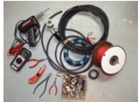
Wire, Coax, Feedline and Tools for building your antenna.

Trust me. I know because experimenting with homemade antennas is the part of ham radio that I love the most.