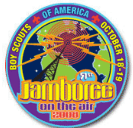
The 2008 JOTA Patch

http://www.arrl.org/news/stories/2009/02/24/10667/?nc=1