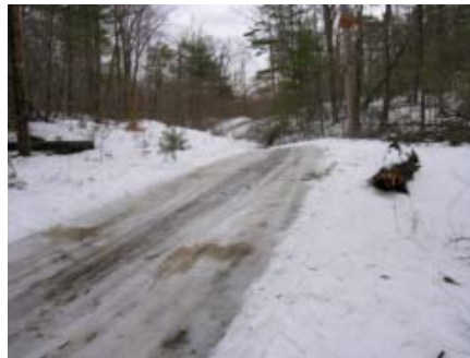
The road was a sheet of ice and water!

As a result of the December ice storm, not only the power line was torn down by the ice on the trees, but the telephone line that provides our "autopatch" and some control functions, was also ripped down and out of service until the first weeks of February 2009.