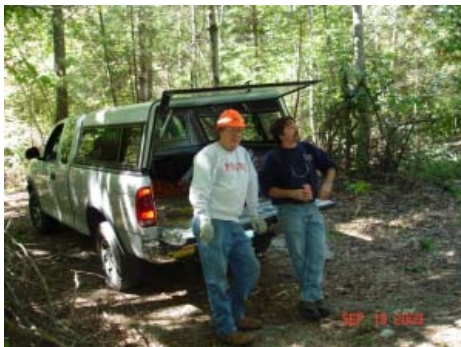
You'd think it was a Railroad Job!