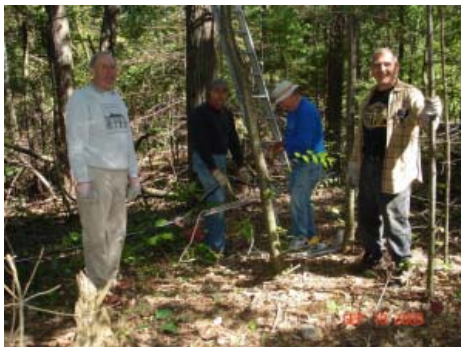
The ladder's up! Now what?