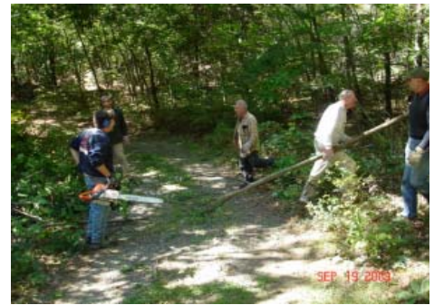
Clearing the Access Road