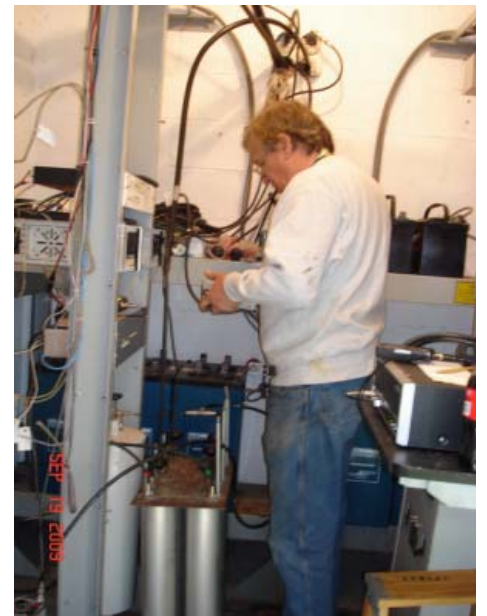
Hmmm! Seems to be a cable left over!