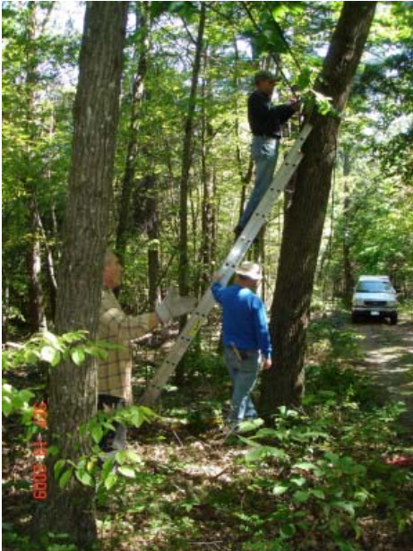
Getting the wires back up