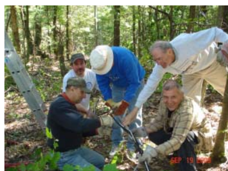
Wire Splicing 101