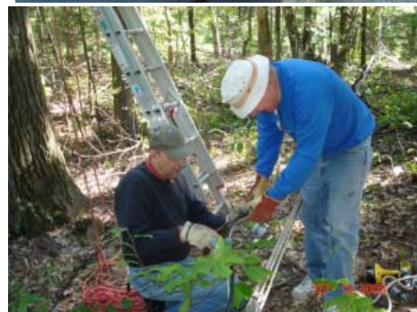
Getting the wires ready to go up